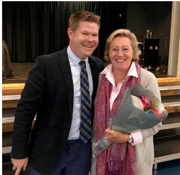
Rangeville Cross Country Team